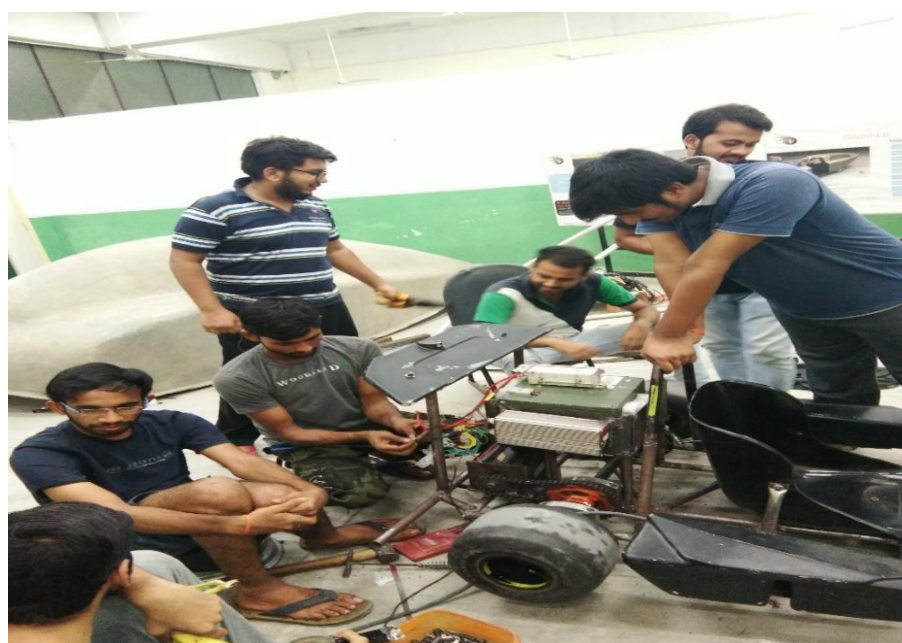
Figure-24: Automobile Innovations by Students of BML Munjal University