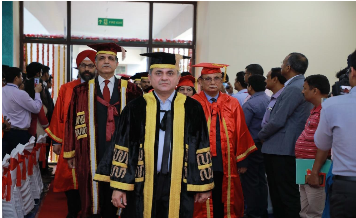
Figure-5: Academic Procession-Third Convocation