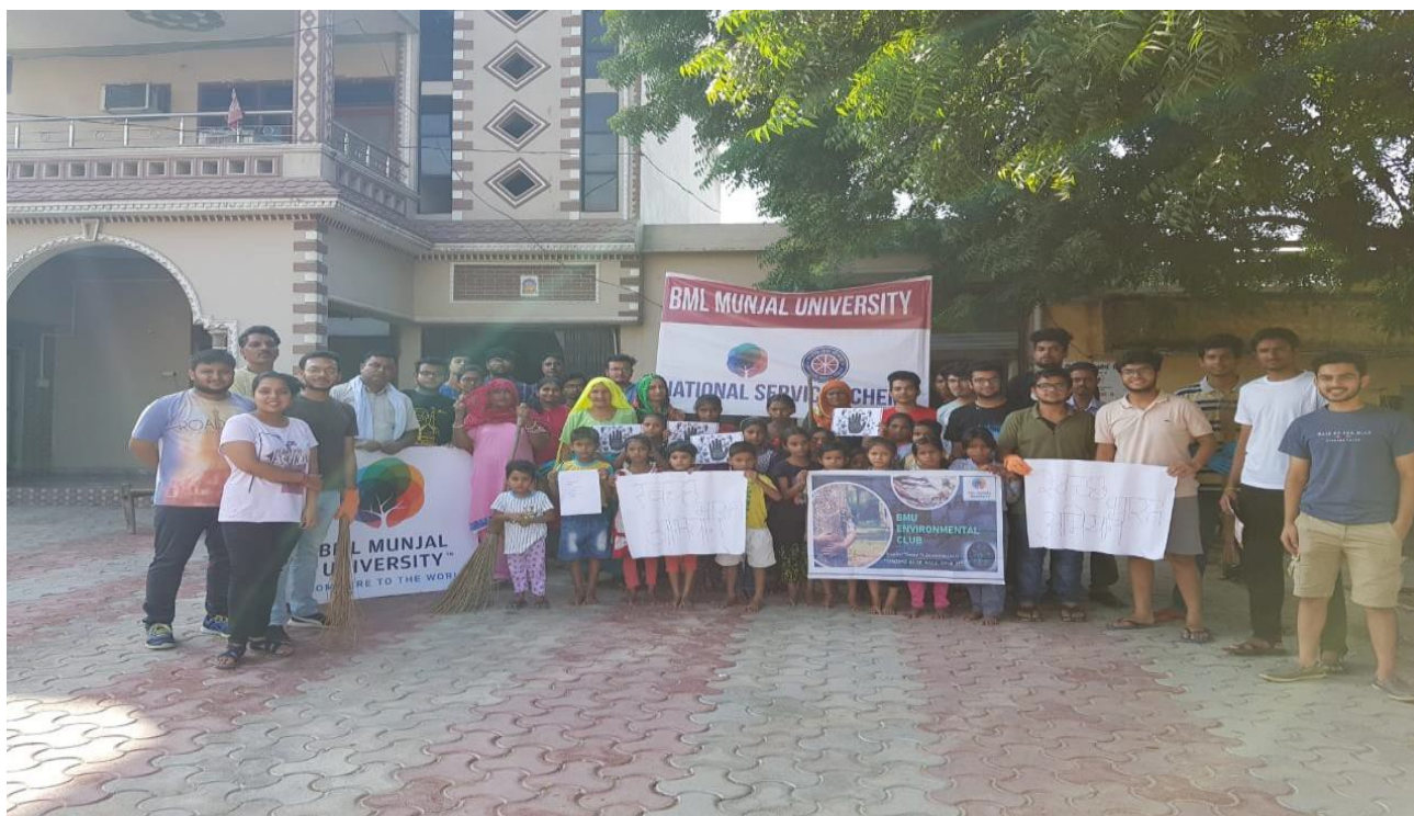
Figure-2: NSS Activities