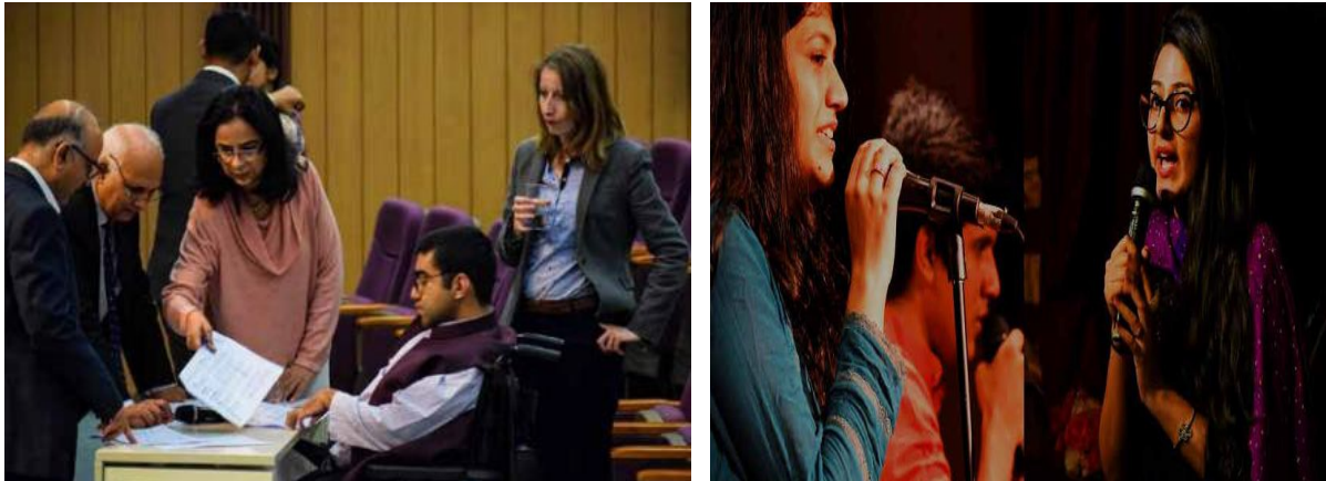
Figure-26: Hult Prize