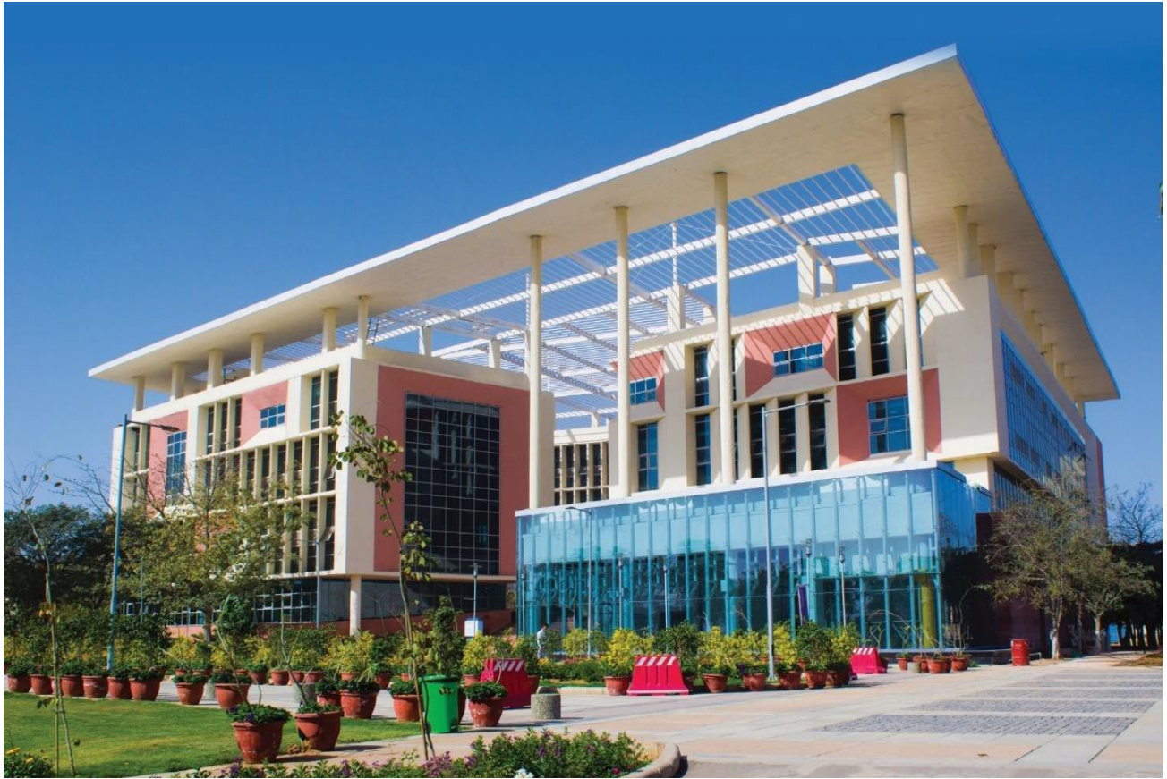
Figure-17: Energy Conservation by Natural Light Usage

(Annexure-11: Details of Campus Round-UP)