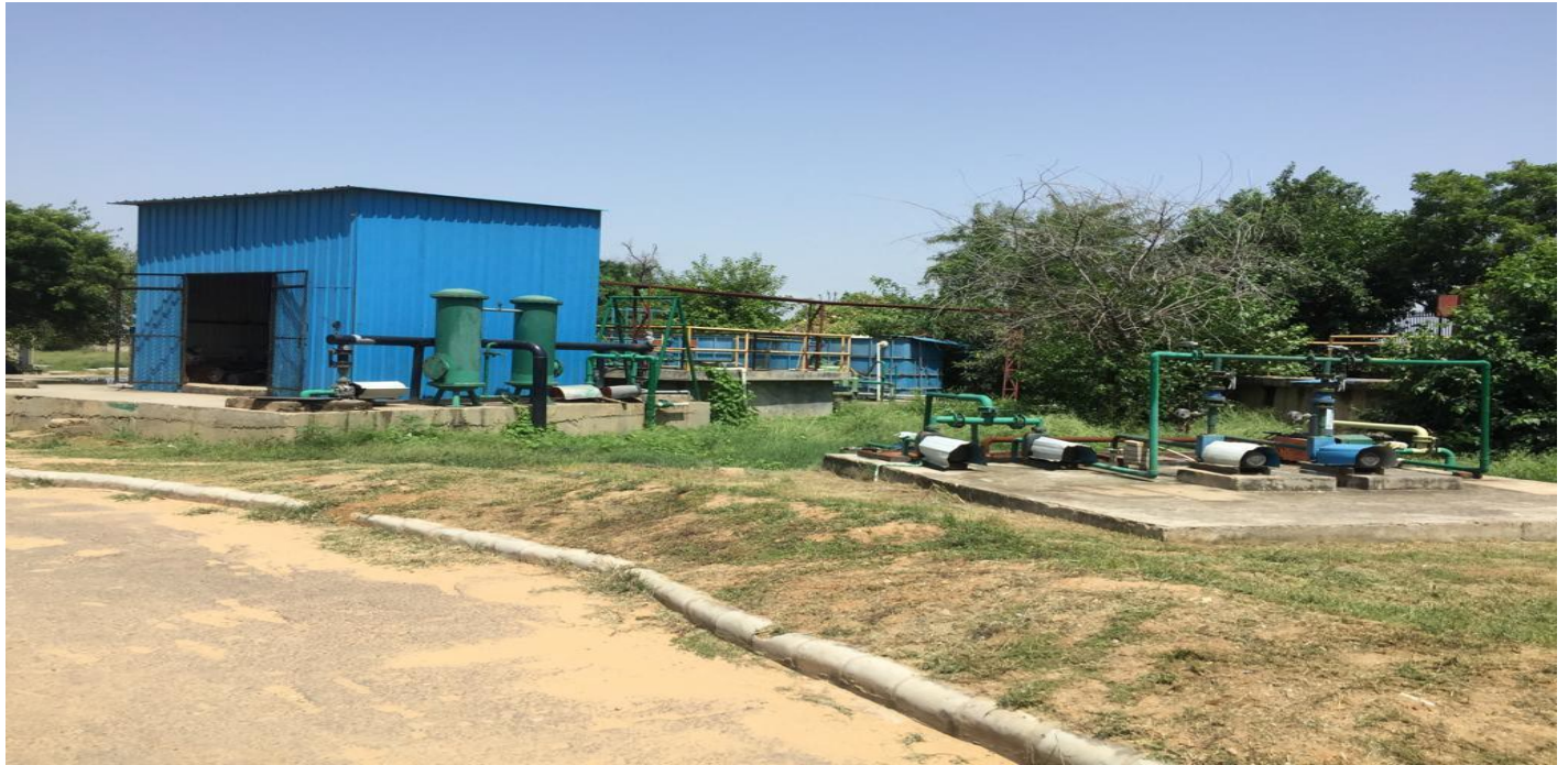
Figure-11: Sewage Treatment Plant