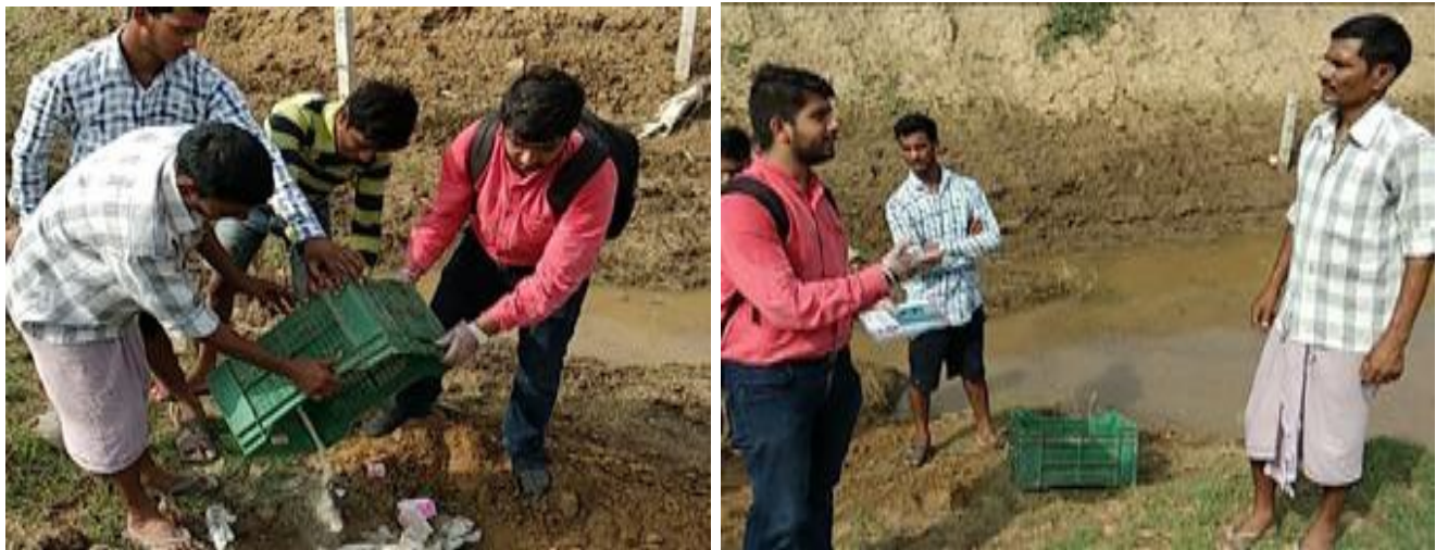
Figure-3: Swachhata Related Activities

The prototype can automatically send the status of a garbage bin by sending a message to the designated mobile. After appreciation from the sarpanch and BDO, the presentation of the same was made to the entire Panchayat Samiti of village Umrain.