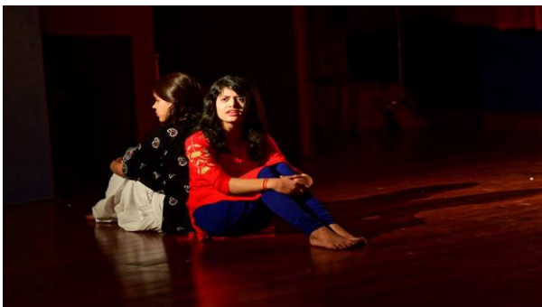
Figure-22: Nirmala-The Stage Play: Through this Drama we covered issues relating to child education, women empowerment