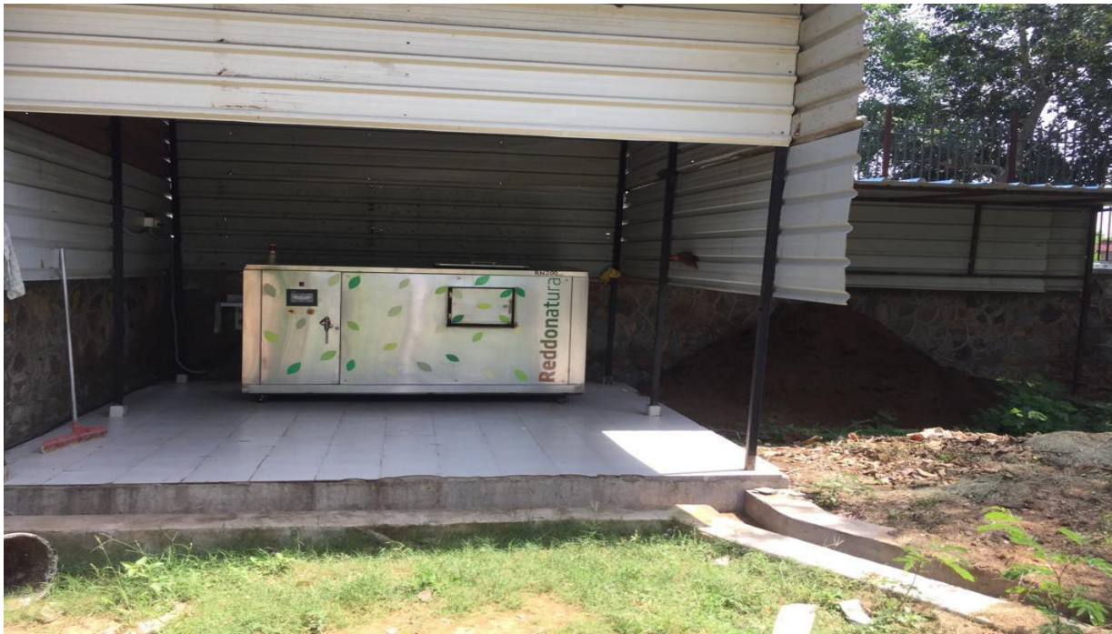
Figure-9: Compost Machine