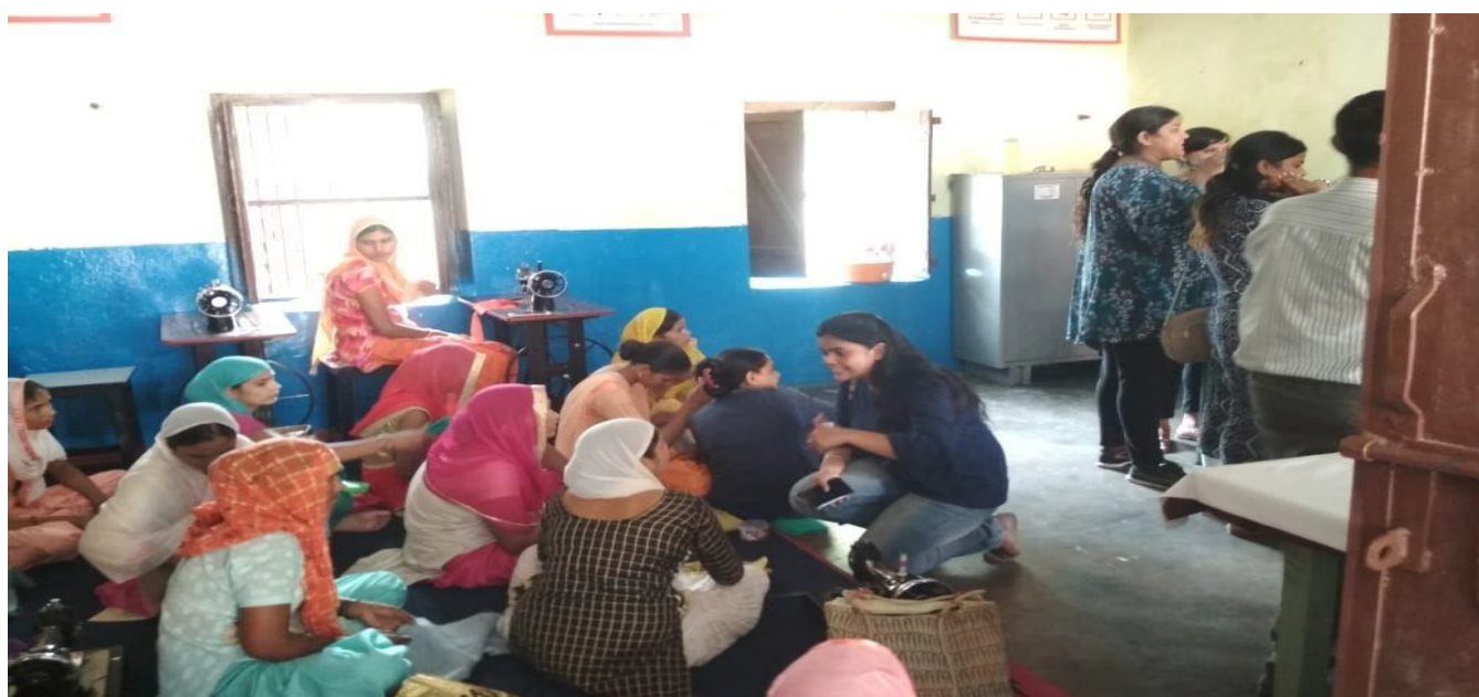
Figure-1: Cleanliness & other Educational Awareness Camps

Visited the village Gujjar Ghatal and Kapriwsas for cleanliness & other educational awareness camps