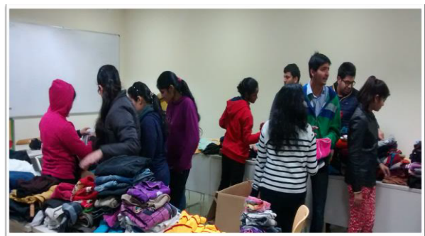
Figure-23: Cover'em up: Winter clothes distribution campaign

Social Media Page: https://www.facebook.com/savera.bmu/