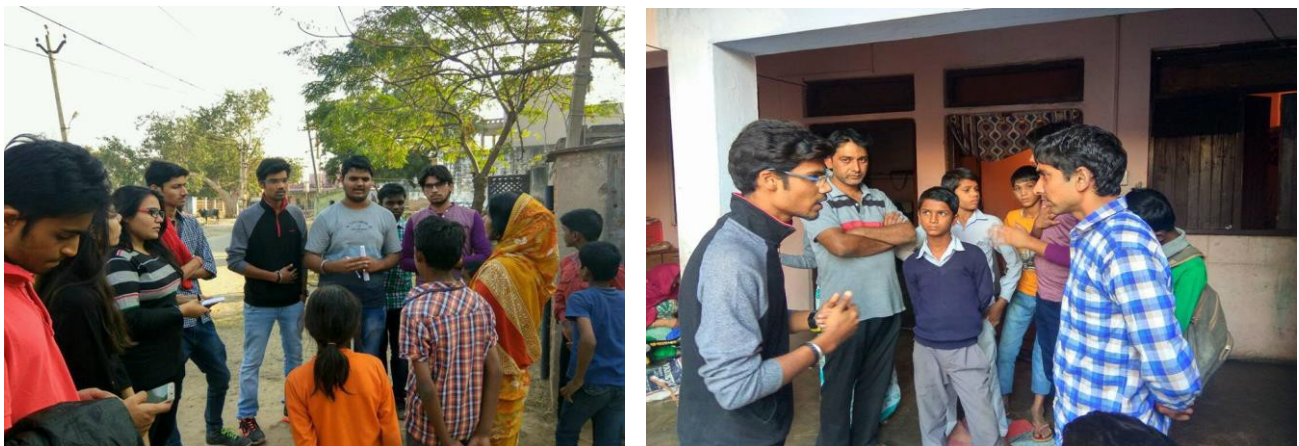
Figure-19: Village Awareness Campaign