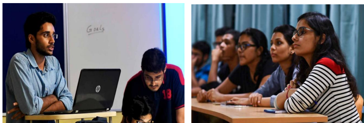
Figure-25: Chai pe Charchas

LiQuiD conducted two Chai pe Charchas over the past semester. The topics were - “Is the glorification of criminal elements in Bollywood movies justified?” and “Does India have any obligation towards accepting the Rohingya refugees?”. Turnout for both the events was really good, especially from the freshers. There were some strong discussions on both the topics, and this was good, as nothing kills a good conversation than conformity.