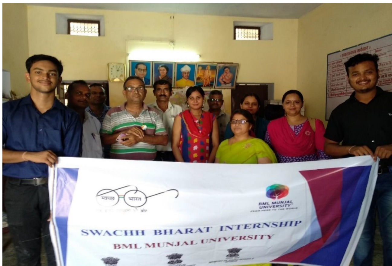
Figure-4: Swachhata promotion work in the adopted Gram Panchayat Umrain, Alwar (Raj.)