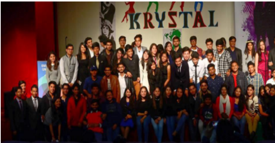
Figure-21: Fund Raising Cultural Programme (Krystal)