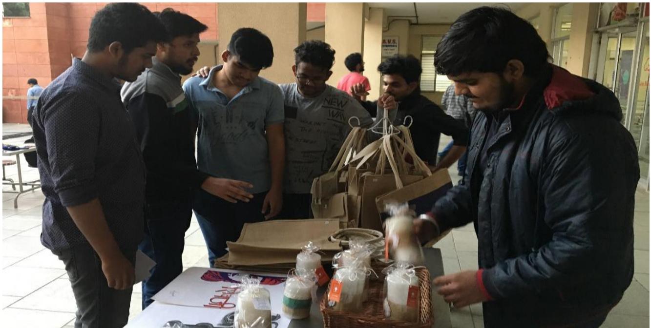
Figure-18: An Entrepreneur's Voice Event