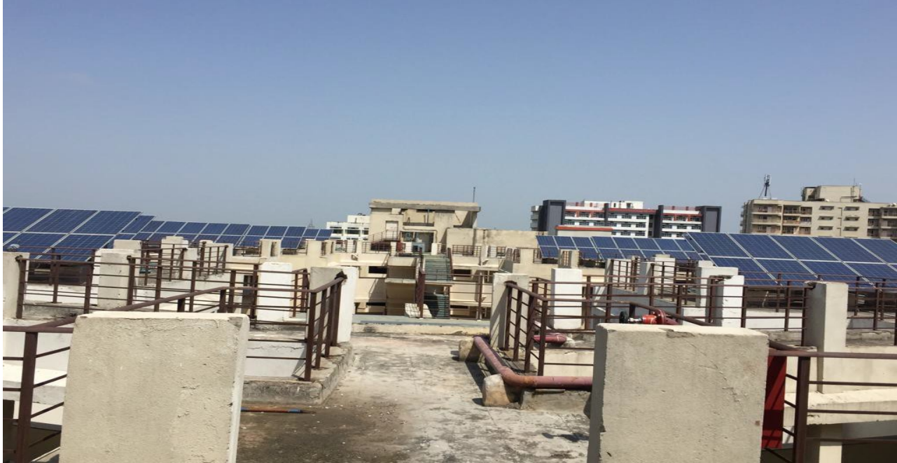
Figure-15: Grid connected photovoltaic power system