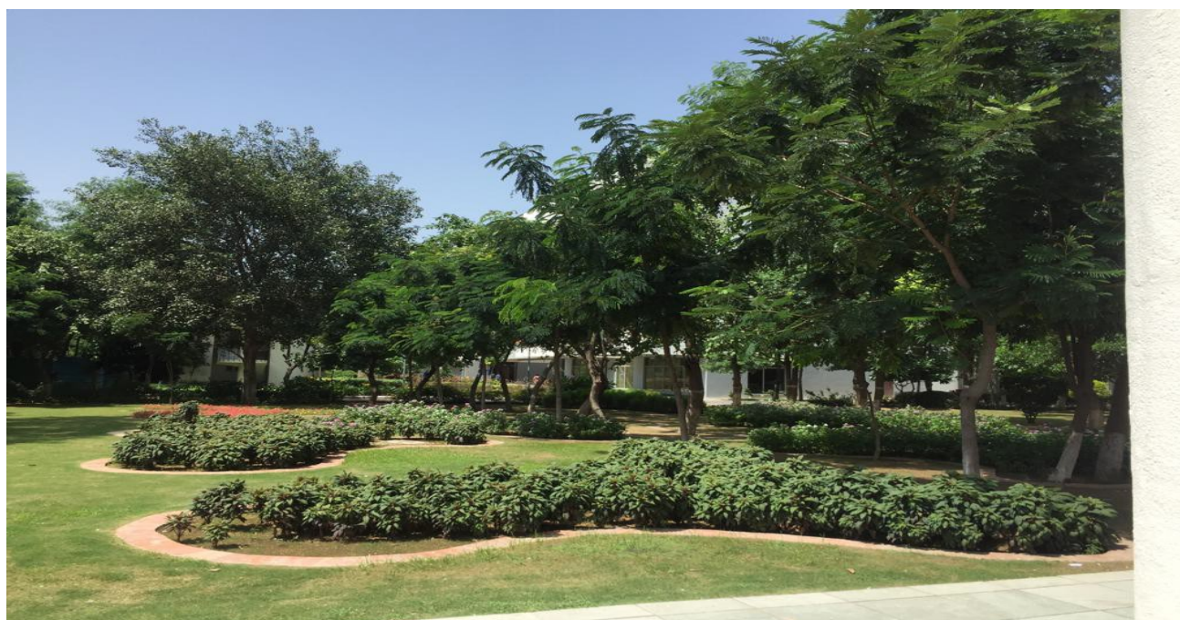
Figure-14: University Green Area