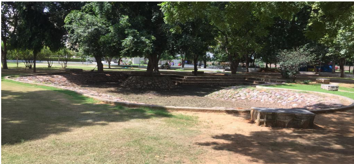
Figure-10: Pond for Rain Water Harvesting