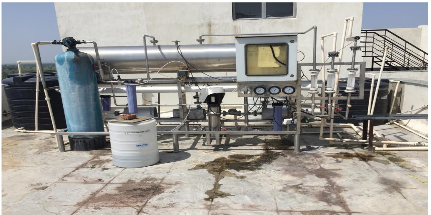
Figure-12: RO System