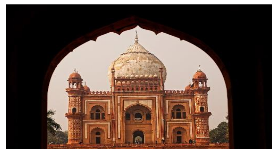
Delhi Photo walk