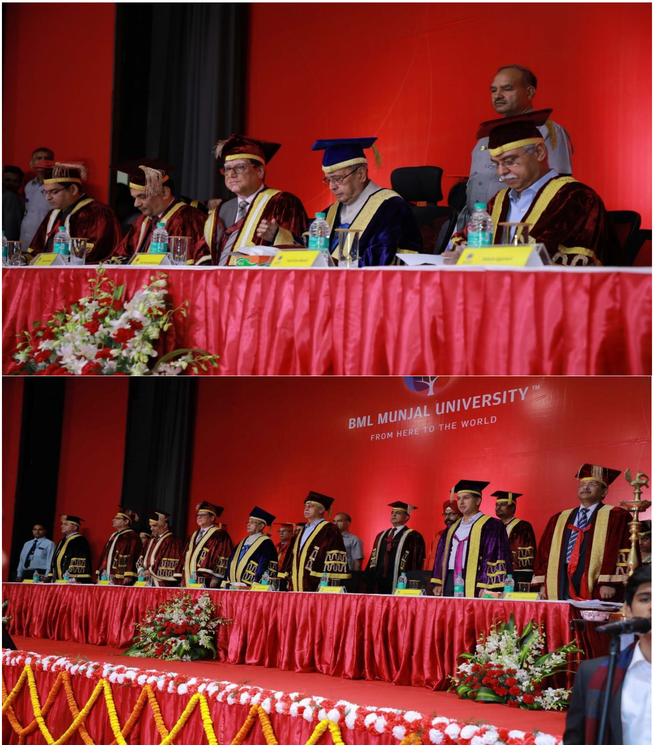
Figure-4: Third Convocation