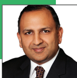
Prof. Pratap Bhanu Mehta Distinguished Visiting Professor PhD from Princeton University, USA